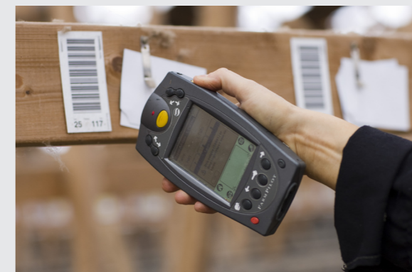
Modern fur-farming management with scanning machine

The European fur-farming makes every effort to guarantee an agricultural activity that has a minimal effect on the environment.