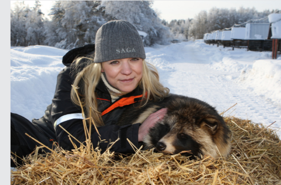
Finnraccoon at Finnish fur-farm

The fur-farming sector is an important support of the global food chain. Indeed European fur farming provides an efficient use of more than 1 million tones of animal by-products each year from the fish and meat industries.